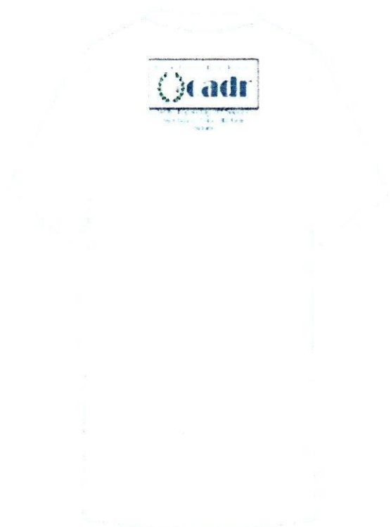
BACK: OADR logo with address