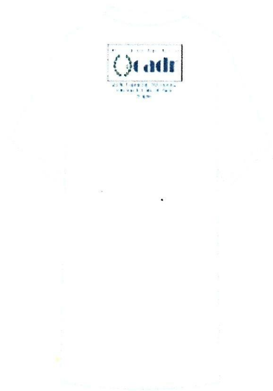
BACK: OADR logo with address